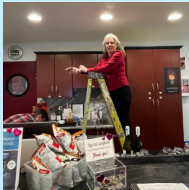
The Glamour of Langham Bartending