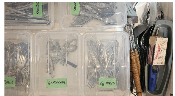
Organized and labelled cutlery!