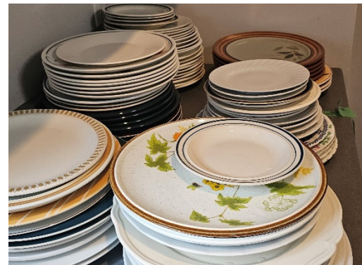
Too many mismatched plates!

All excess supplies will go into the Costume Loft and Prop sale at the end of July.