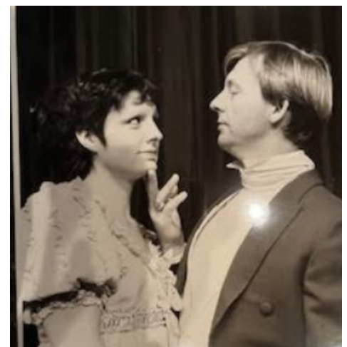
Pride & Prejudice