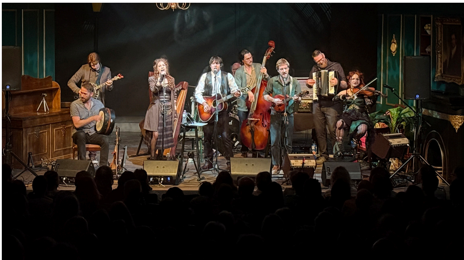
The Hounds of Cuchulain performing on the set of An Inspector Calls

For more information about The Hounds of Cuchulain and their music, you can check out their website at www.hounds-of-cuchulain.com