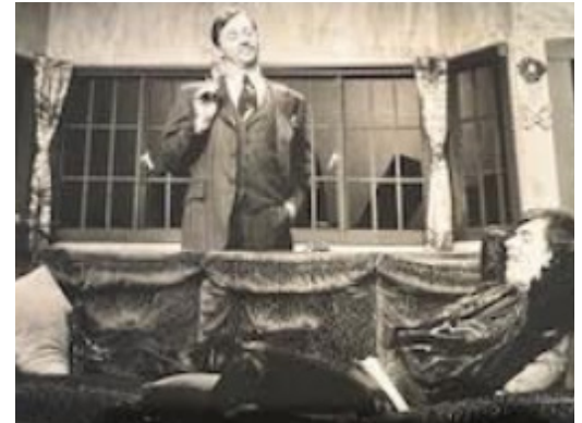
Entertaining Mr. Sloan