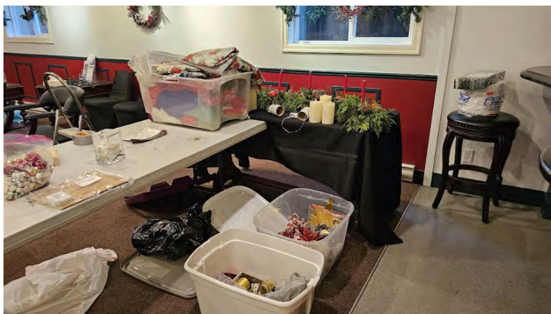
Decorating the lounge for the holiday party.