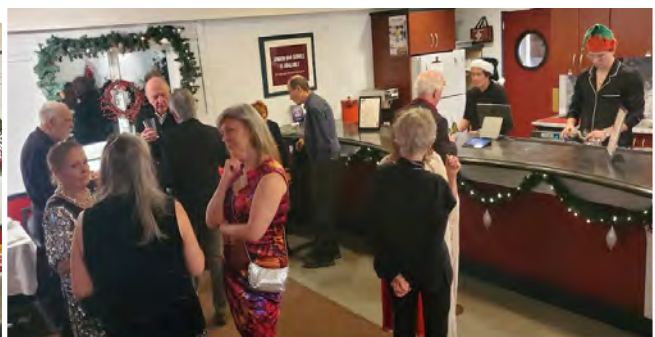
Everyone enjoying the festivities